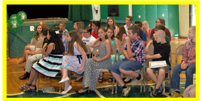
A.J. Schmidt Elementary