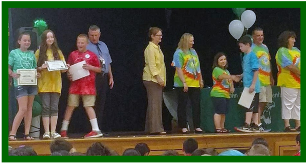
J.T. Waugh Elementary