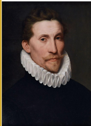
Portrait of an Unknown Man Frans Pourbus the Elder

Above, we have Angelina Coszenza reconstructing Piet Mondrian's 'Composition in Red, Blue, Yellow and Black' with folded squares of colored t-shirts.