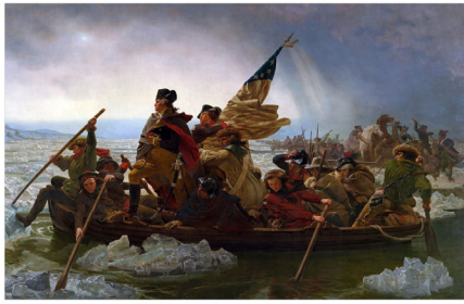
Washington Crossing the Delaware Emanuel Leutze