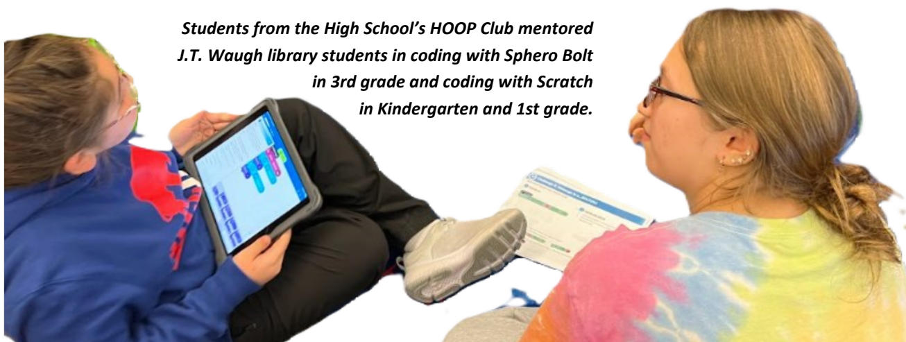
Students from the High School's HOOP Club mentored J.T. Vaughn library students in coding with Sphero Bolt in 3rd grade and coding with Scratch in Kindergarten and 1st grade.