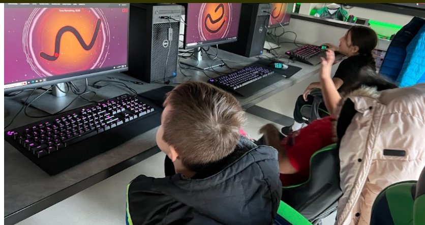
During a field trip to the High School Esports lab, these J.T. Vaughn 2nd graders saw how AP Computer Science students build coding skills