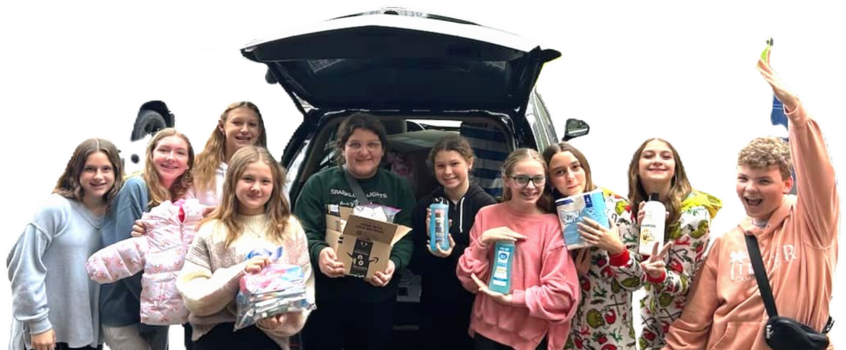
Right: 7th graders from William G. Houston Middle School drop off donations collected at the school for Operation Good Neighbor.