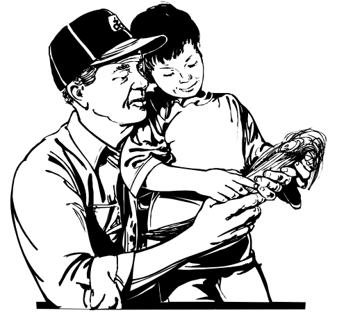
Fact Sheet on Other Health Impairments (FS15)

Literally millions of people worldwide are affected by sickle cell anemia. The disease is inherited and primarily affects people of African descent. Symptoms include chronic anemia and periodic episodes of pain (in the arms, legs, chest, and abdomen).