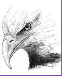
Name: Taylor Seneca College/Future Plans: Finger Lakes Community College